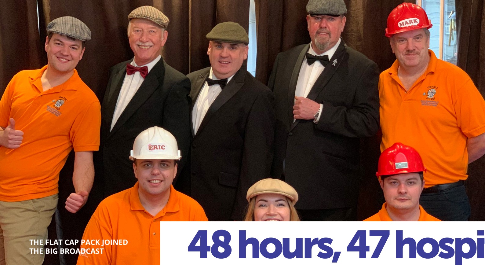
THE FLAT CAP PACK JOINED THE BIG BROADCAST