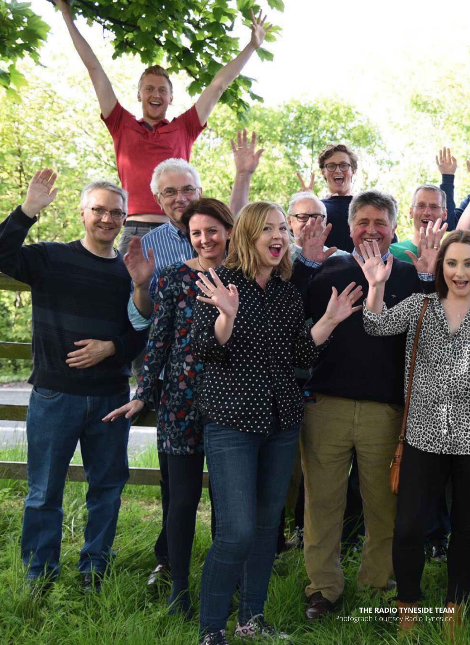
THE RADIO TYNESIDE TEAM