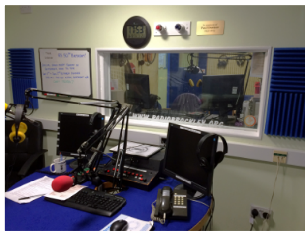
Pictured above New look studios for Radio Brockley.