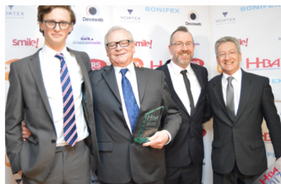
Station of the Year - Radio Tyneside