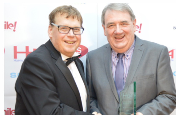
Best Speech Package - Radio Brockley