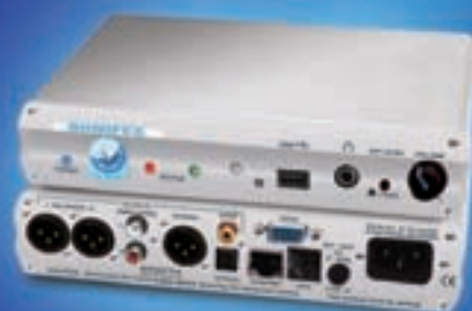
PS-PLAY IP to Audio Streaming Decoder