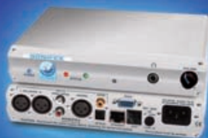
PS-SEND Audio to IP Streaming Encoder