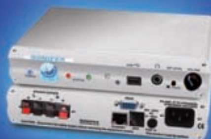
PS-AMP IP to Speakers Streaming Decoder

For further details about the Pro Audio Streamers, please contact our sales team at sales@sonifex.co.uk or visit our website at: http://www.sonifex.co.uk/prostreamer/index.shtml