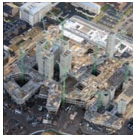
Development at 2012 of the New Southern General Hospital due to open in 2015.

During the course of August, discussions took place about the current position of the Southern Sound and what needed to be done to prepare the Station going into the 2nd decade of the 21st Century. One of the key drivers to consider was the development of the NEW Southern General Hospital – a new hospital development which will make the hospital one of the biggest and most modern in Europe by 2015 with an estimated turnover of 110,000 patients per year.