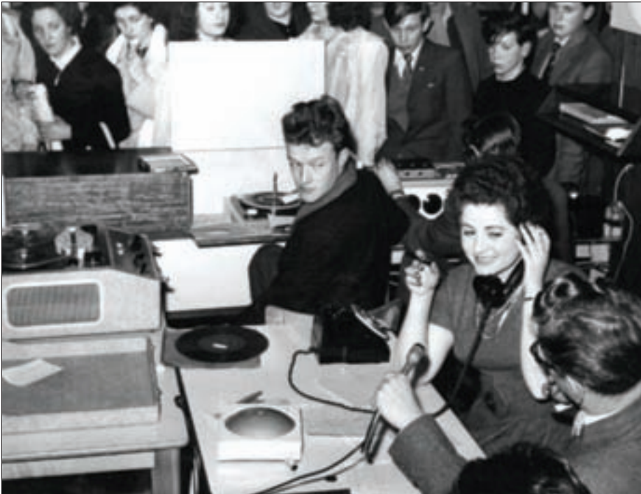
Outside broadcast from Lewis's in Corporation Street

A BBC2 documentary will show behind the scenes of the station as part of the eight-part series Keeping Britain Alive: The NHS in a Day .