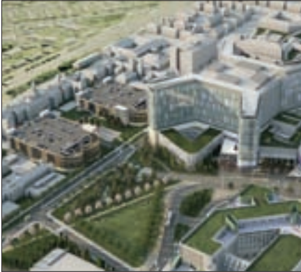
Computer vision of the completed Hospital in 2015

Identified in the forefront of the plan is a vision of how future development of some of the surrounding area could be redeveloped to attract supporting scientific and commercial technology based businesses to