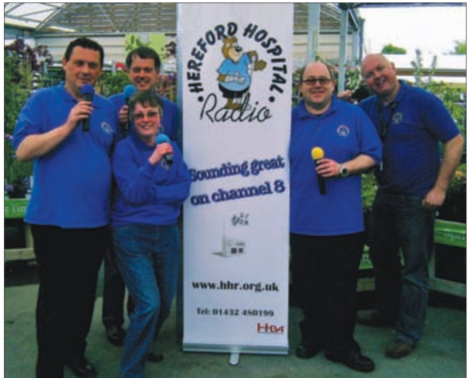
The HHR team at Wyevale Garden Centre

Wye Valley NHS Trust Annual Report, our work was recognised and we had a small article about our work and a photo of some of our presenters in our studios.