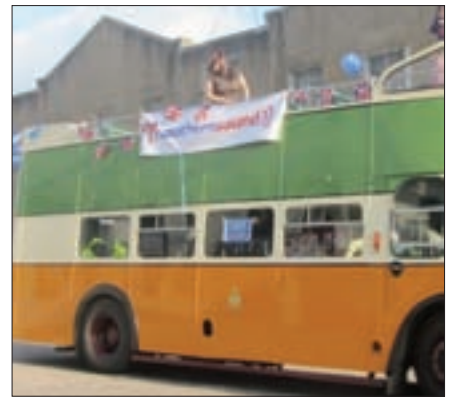
Southern Sound supporting the Govan Annual Fair in 2012