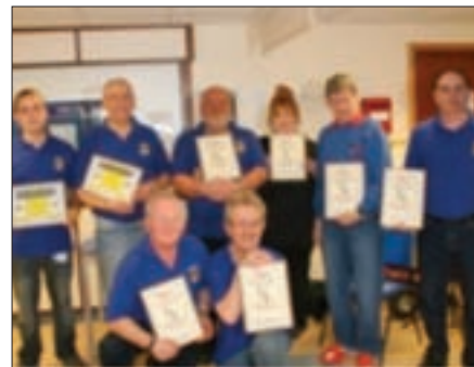
Hospital Radio Lynn are presented with their long service certificates

Hospital Radio is a wonderful charity and I'm delighted we have been able to support this worthwhile cause. It is highly regarded by patients and staff alike and plays an import role in hospital life.'