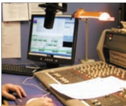
Southern Sound at the Southern General Hospital Glasgow

However, with the continued commitment and dedication of the committee members, broadcasting now averaging around 39 hours a week and a thriving training programme bringing in fresh talent including experienced broadcasters with the likes of Elaine Berry former Radio Clyde Broadcaster, things are looking good up again for the station.