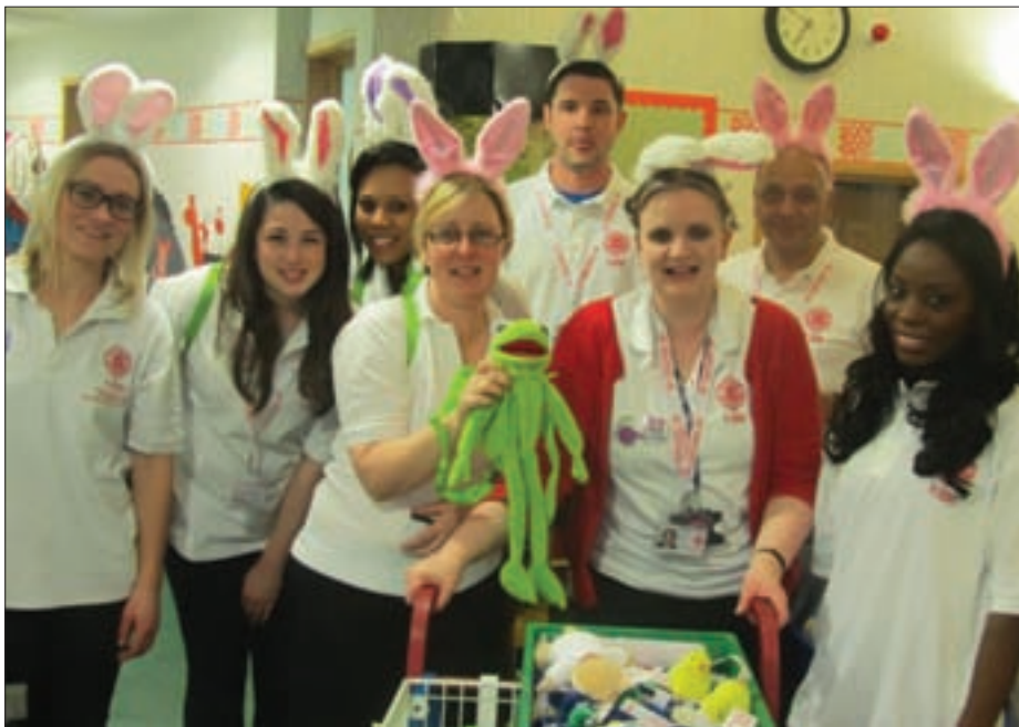
The Radio Lollipop team at Bristol

On 27th March, the volunteers of children's charity Radio Lollipop, dressed as Easter bunnies, took to the wards to give out Kermit the Frog backpacks filled with Easter