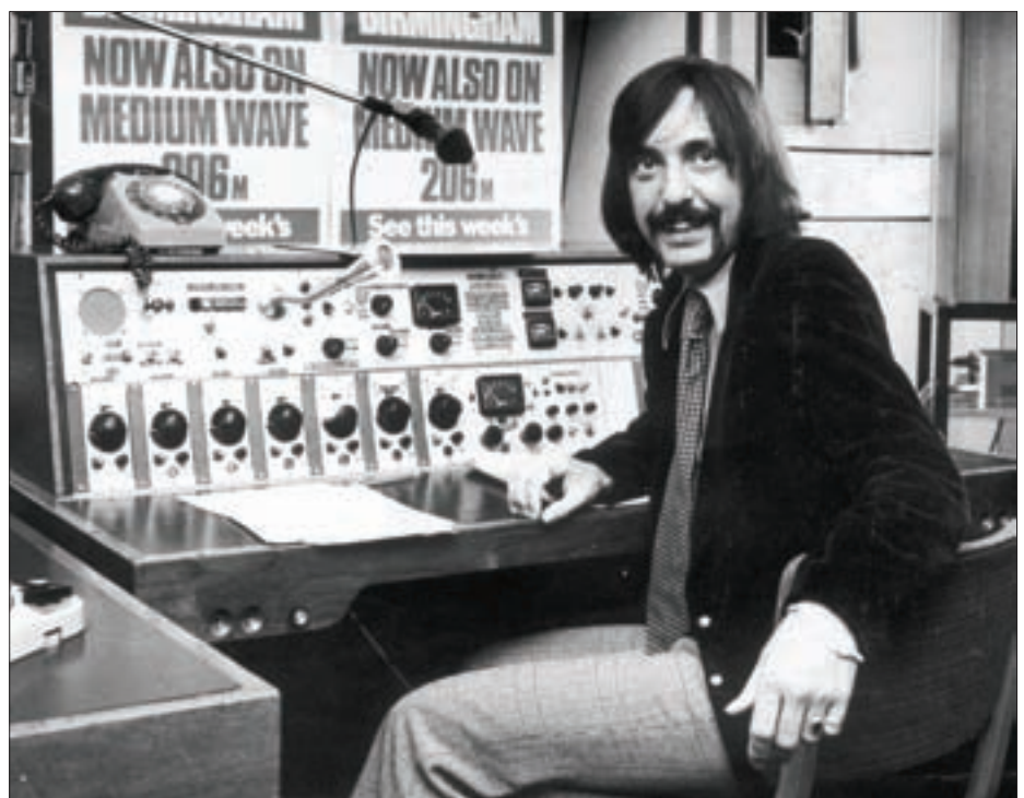
Birmingham's Hospital Radio

'I'd like to thank the BBC for giving us this opportunity.'